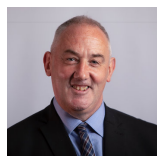
Paul McLennan Scottish National Party