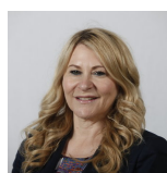
Deputy Convener Pauline McNeill Scottish Labour