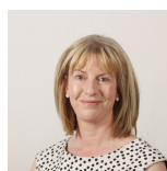
Shona Robison Scottish National Party