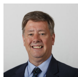
Keith Brown Scottish National Party