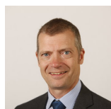
Graham Simpson Scottish Conservative and Unionist Party