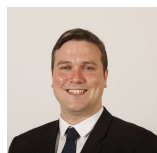
Tom Arthur Scottish National Party