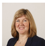
Alison Johnstone Scottish Green Party