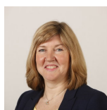
Alison Johnstone Scottish Green Party