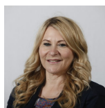
Deputy Convener Pauline McNeill Scottish Labour